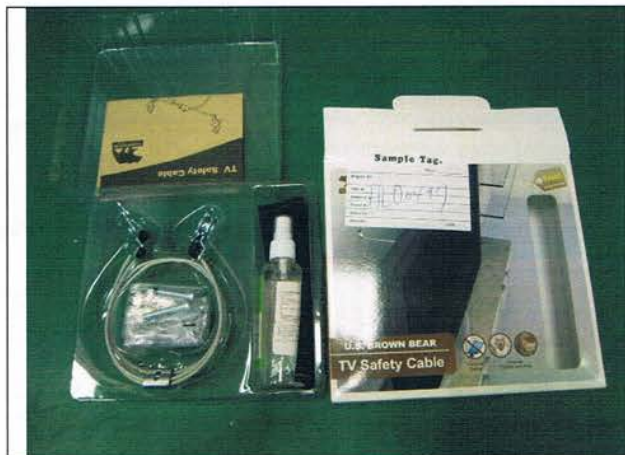
照片 "A"- 測試樣品