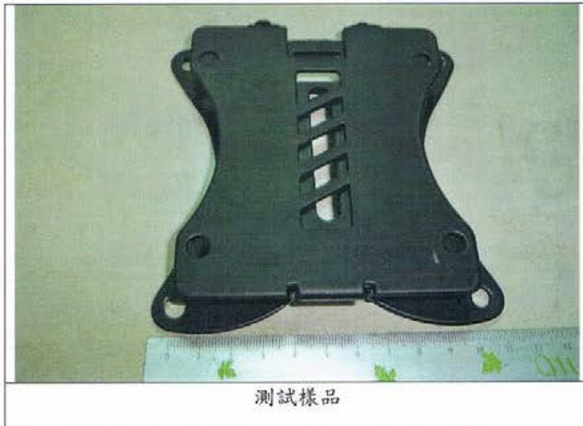
----- 1 ----- 測試樣品