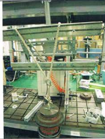
照片 "B"- 測試架設